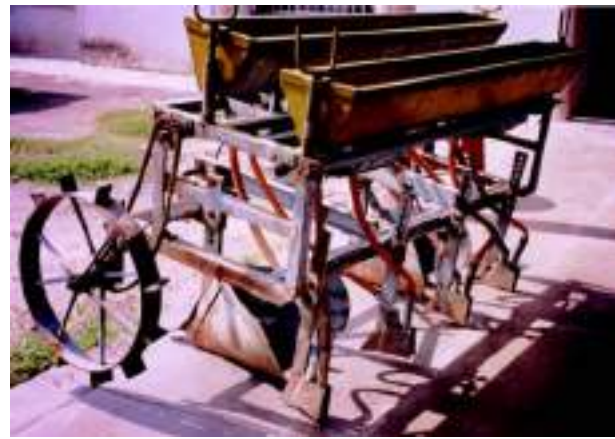
Fig. 4.16: Modern technological equipments used in agriculture

institutional reforms. Thus, collectivisation, consolidation of holdings, cooperation and abolition of zamindari, etc. were given priority to bring about institutional reforms in the country after Independence. 'Land reform' was the main focus of our First Five Year Plan. The right of inheritance had already led to fragmentation of land holdings necessitating consolidation of holdings.