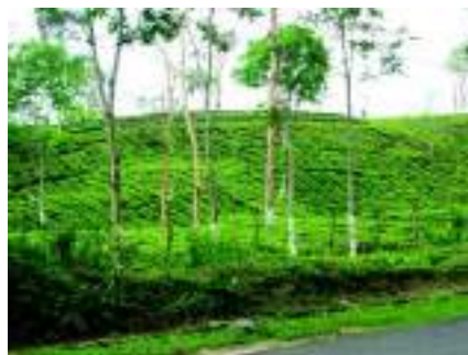
Fig. 4.10: Tea Cultivation

Coffee: In 2008 India produced 3.2 per cent of the world coffee production. Indian coffee is known in the world for its good quality. The Arabica variety initially brought from Yemen is produced in the country. This variety is in great demand all over the world. Initially its cultivation was introduced on the Baba Budan Hills and even today its cultivation is confined to the Nilgiri in Karnataka, Kerala and Tamil Nadu.