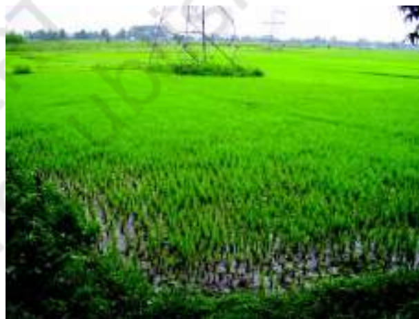
Fig. 4.4 (a): Rice Cultivation

Rice is grown in the plains of north and north-eastern India, coastal areas and the deltaic regions. Development of dense network