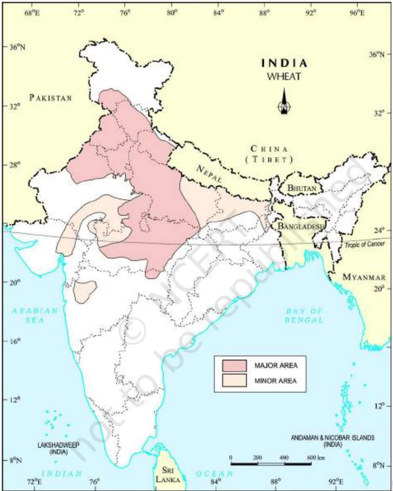
India: Distribution of Wheat