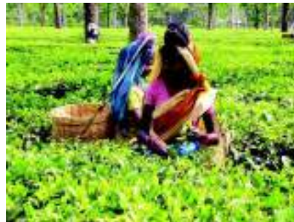
Fig. 4.11: Tea-leaves Harvesting

tropical as well as temperate fruits. Mangoes of Maharashtra, Andhra Pradesh, Telangana, Uttar Pradesh and West Bengal, oranges of Nagpur and Cherrapunjee (Meghalaya), bananas of Kerala, Mizoram, Maharashtra and Tamil Nadu, lichi and guava of Uttar Pradesh and Bihar, pineapples of Meghalaya, grapes of Andhra Pradesh, Telangana and Maharashtra, apples, pears, apricots and walnuts of Jammu and Kashmir and Himachal Pradesh are in great demand the world over.