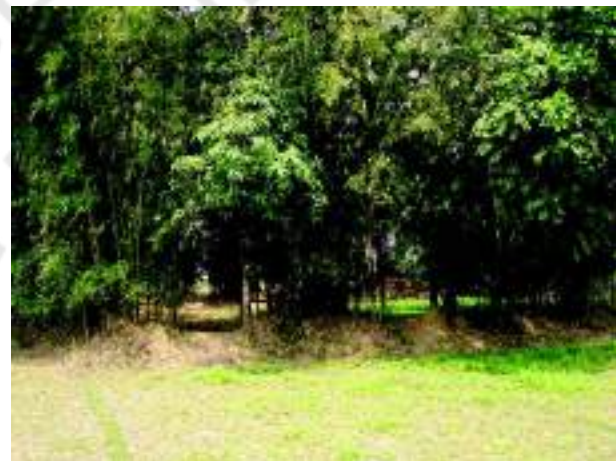
Fig. 4.3: Bamboo plantation in North-east

Karnataka are some of the important plantation crops grown in these states. Since the production is mainly for market, a well-developed network of transport and communication connecting the plantation areas, processing industries and markets plays an important role in the development of plantations.