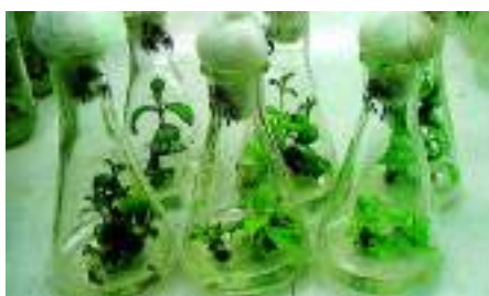
Fig. 4.17: Tissue culture of teak clones

Under globalisation, particularly after 1990, the farmers in India have been exposed to new challenges. Despite being an important producer of rice, cotton, rubber, tea, coffee, jute and spices our agricultural products are not able to compete with the developed countries because of the highly subsidised agriculture in those countries.