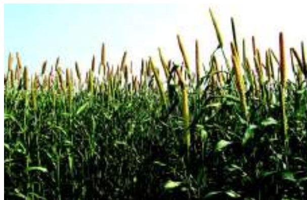
Fig. 4.6: Bajra Cultivation

Bajra grows well on sandy soils and shallow black soil. Major Bajra producing States were: Rajasthan, Uttar Pradesh, Maharashtra, Gujarat and Haryana in 2011-12. Ragi is a