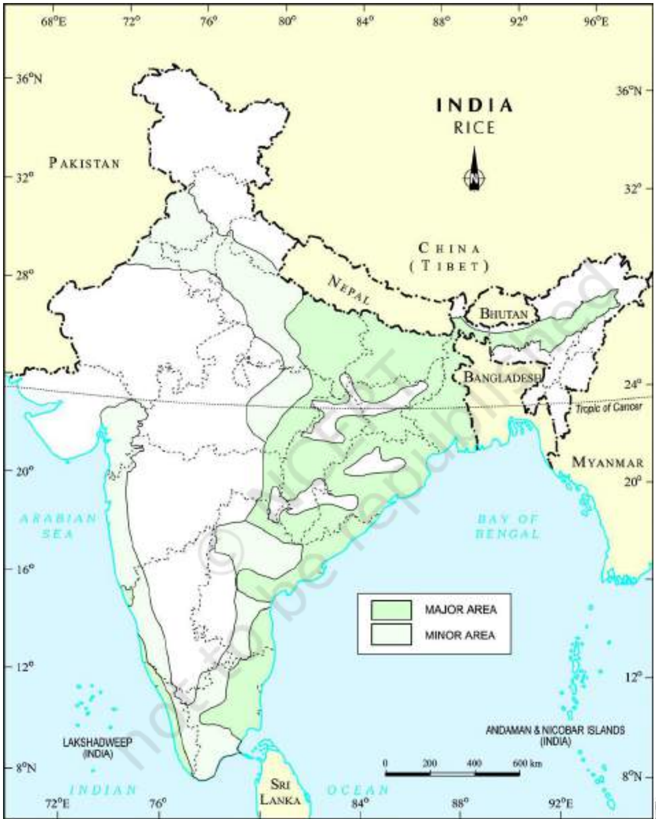
India: Distribution of Rice