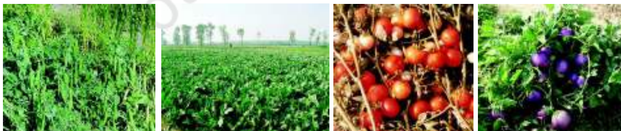
Fig. 4.13: Cultivation of vegetables – peas, cauliflower, tomato and brinjal

India produces about 13 per cent of the world's vegetables. It is an important producer of pea, cauliflower, onion, cabbage, tomato, brinjal and potato.