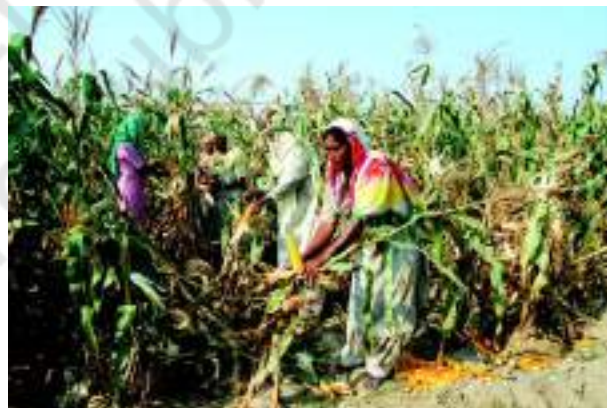
Fig. 4.7: Maize Cultivation

Maize: It is a crop which is used both as food and fodder. It is a kharif crop which requires temperature between 21°C to 27°C and grows well in old alluvial soil. In some states like Bihar