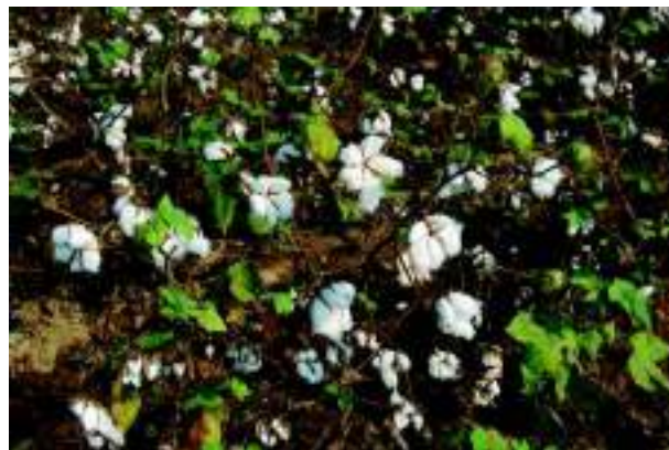
Fig. 4.15: Cotton Cultivation

Cotton: India is believed to be the original home of the cotton plant. Cotton is one of the main raw materials for cotton textile industry. In 2008 India was second largest producer of cotton after China. Cotton grows well in drier parts of the black cotton soil of the Deccan