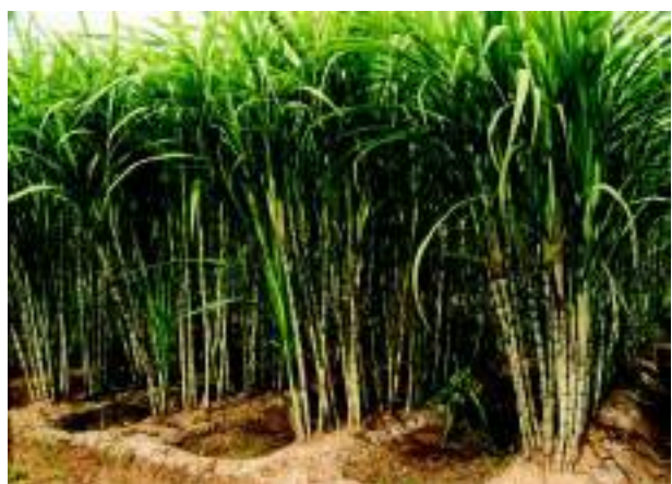
Fig. 4.8: Sugarcane Cultivation

Sugarcane: It is a tropical as well as a subtropical crop. It grows well in hot and humid climate with a temperature of 21°C to 27°C and an annual rainfall between 75cm. and 100cm. Irrigation is required in the regions of low rainfall. It can be grown on a variety of