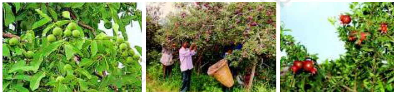
Fig. 4.12: Apricots, apple and pomegranate

tropical as well as temperate fruits. Mangoes of Maharashtra, Andhra Pradesh, Telangana, Uttar Pradesh and West Bengal, oranges of Nagpur and Cherrapunjee (Meghalaya), bananas of Kerala, Mizoram, Maharashtra and Tamil Nadu, lichi and guava of Uttar Pradesh and Bihar, pineapples of Meghalaya, grapes of Andhra Pradesh, Telangana and Maharashtra, apples, pears, apricots and walnuts of Jammu and Kashmir and Himachal Pradesh are in great demand the world over.