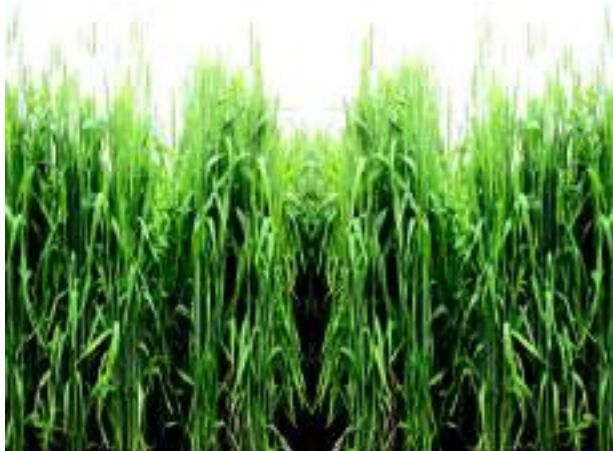
Fig. 4.5: Wheat Cultivation

Wheat: This is the second most important cereal crop. It is the main food crop, in north and north-western part of the country. This rabi crop requires a cool growing season and a bright sunshine at the time of ripening. It requires 50 to 75 cm of annual rainfall evenly-distributed over the growing season. There are two important wheat-growing zones in the country – the Ganga-Satluj plains in the north-west and black soil region of the Deccan. The major wheat-producing states are Punjab, Haryana, Uttar Pradesh, Bihar, Rajasthan and parts of Madhya Pradesh.