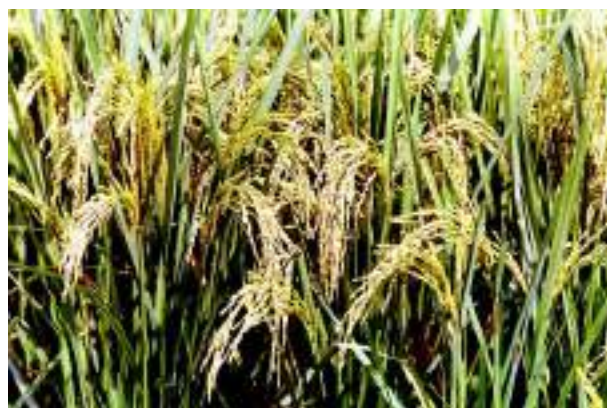
Fig. 4.4 (b): Rice is ready to be harvested in the field