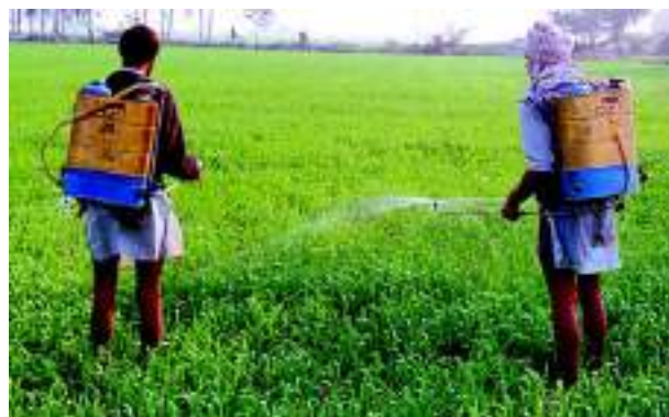
Fig. 4.18: Problems associated with heavy pesticide use are widely recognised in developed and developing countries

Can you name any gene modified seed used vastly in India?