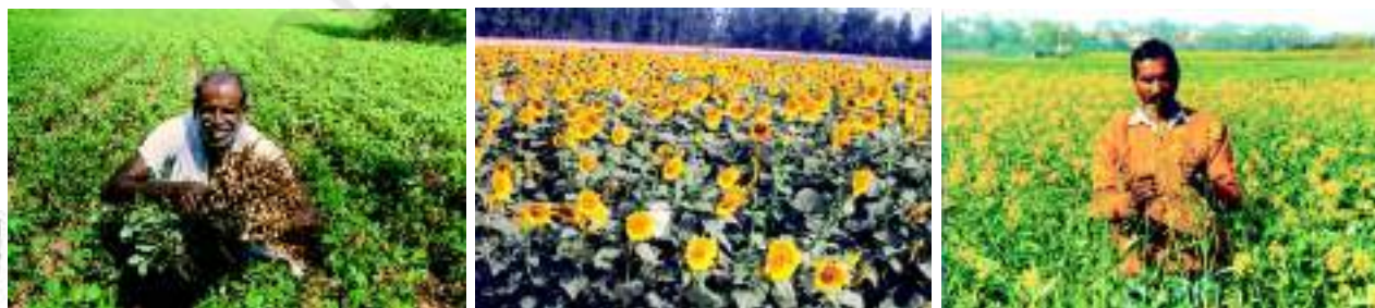
Fig. 4.9: Groundnut, sunflower and mustard are ready to be harvested in the field

Tea: Tea cultivation is an example of plantation agriculture. It is also an important beverage crop introduced in India initially by the British. Today, most of the tea plantations are owned by Indians. The tea plant grows well in tropical and sub-tropical climates endowed with deep and fertile well-drained soil, rich in humus and organic matter. Tea bushes require warm and moist frost-free climate all through the year. Frequent showers evenly distributed over the year ensure continuous growth of tender leaves. Tea is a labour-intensive industry. It requires abundant,