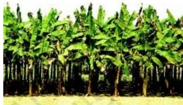
Fig. 4.2: Banana plantation in Southern part of India

In India, tea, coffee, rubber, sugarcane, banana, etc.. are important plantation crops. Tea in Assam and North Bengal coffee in