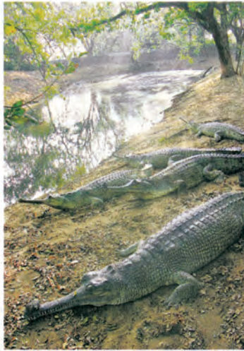
CRITICALLY ENDANGERED: Captive gharial at the Madras C

W ISPY tendrils of mist rise delicately from the water surface, tinged gold by the dawn. Your breath hangs as little clouds of vapour as you gaze upon the Girwa River on a cold winter morning. A trio of hollow clapping sounds from the other side of the river, half a kilometre away tells you that an adult male gharial is advertising his presence. It is the height of the breeding season. The place seems trapped in a time in early history when man was still clad in animal skins. It is only as the sun rises higher and burns the mist off the water that the world comes into focus with appalling clarity. The five-km stretch of the Girwa River in Katarniaghat Wildlife Sanctuary is one of the only three wild breeding sites left in the world for the most unique of all the