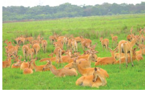
Fig. 2.4: Rhino and deer in Kaziranga National Park

dwindled to 1,827 from an estimated 55,000 at the turn of the century. The major threats to tiger population are numerous, such as poaching for trade, shrinking habitat, depletion of prey base species, growing human population, etc. The trade of tiger skins and the use of their bones in traditional medicines, especially in the Asian countries left the tiger population on the verge of extinction. Since India and Nepal provide habitat to about two-thirds of the surviving tiger population in the world, these two nations became prime targets for poaching and illegal trading.