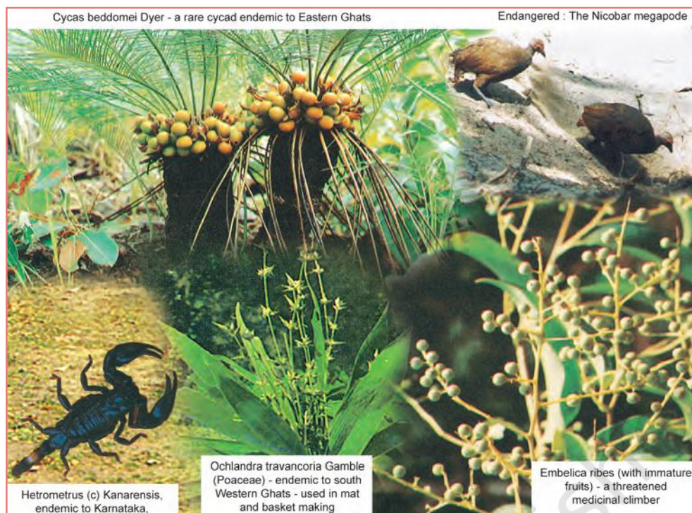
Fig. 2.2: A few extinct, rare and endangered species

a resource obtaining directly and indirectly from the forests and wildlife – wood, barks, leaves, rubber, medicines, dyes, food, fuel, fodder, manure, etc. So it is we ourselves who have depleted our forests and wildlife. The greatest damage inflicted on Indian forests was during the colonial period due to the expansion of the railways, agriculture, commercial and scientific forestry and mining activities. Even after Independence, agricultural expansion continues to be one of the major causes of depletion of forest resources. Between 1951 and 1980, according to the Forest Survey of India, over 26,200 sq. km. of forest area was converted into agricultural land all over India. Substantial parts of the tribal belts, especially in the north-eastern and central India, have been deforested or degraded by shifting cultivation (jhum), a type of 'slash and burn' agriculture.