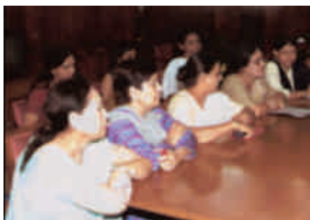
The above photo shows a few women Members of Parliament.

Why do you think there are so few women in Parliament? Discuss.