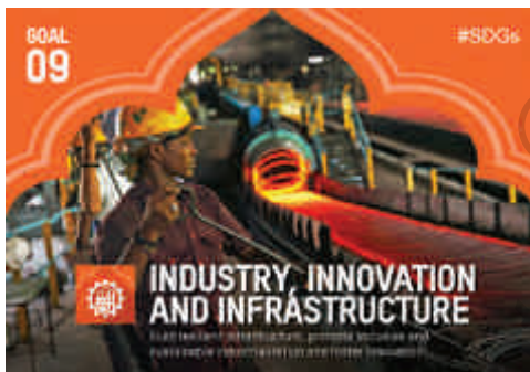
Sustainable Development Goal (SDG) www.in.undp.org

In 1984, there were very few laws protecting the environment in India, and there was hardly any enforcement of these laws. The environment was treated as a 'free' entity and any industry could pollute the air and water without any restrictions. Whether it was our rivers, air, groundwater - the environment was being polluted and the health of people disregarded.