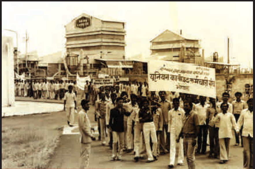
Members of UC Employees Union protesting

The disaster was not an accident. UC had deliberately ignored the essential safety measures in order to cut costs. Much before the Bhopal disaster, there had been incidents of gas leak killing a worker and injuring several.