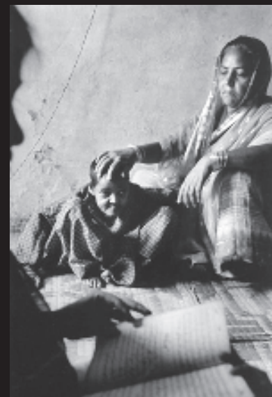
A child severely affected by the gas

Most of those exposed to the poison gas came from poor, working-class families, of which nearly 50,000 people are today too sick to work. Among those who survived, many developed severe respiratory disorders, eye problems and other disorders. Children developed peculiar abnormalities, like the girl in the photo.