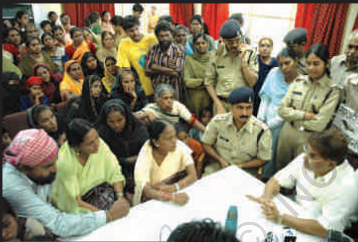
Gas victims with the Gas Relief Minister

Despite the overwhelming evidence pointing to UC as responsible for the disaster, it refused to accept responsibility.