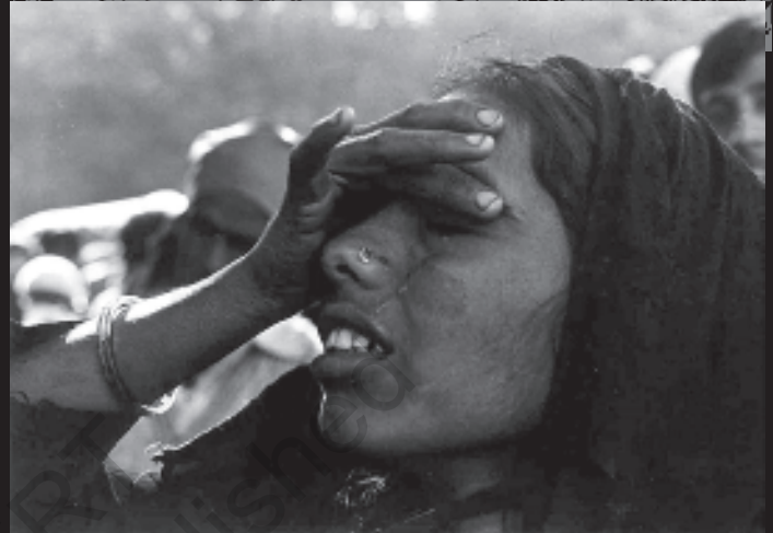
The next morning