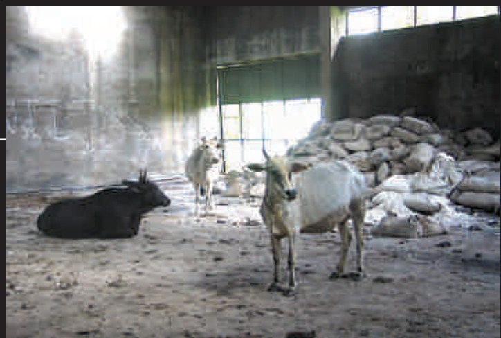
Bags of chemicals lie strewn around the UC plant

UC stopped its operations, but left behind tons of toxic chemicals. These have seeped into the ground, contaminating water. Dow Chemical, the company who now owns the plant, refuses to take responsibility for clean up.