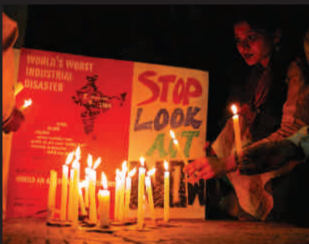
The struggle for justice goes on...

24 years later, people are still fighting for justice: for safe drinking water, for health-care facilities and jobs for the people poisoned by UC. They also demand that Anderson, the UC chairman who faces criminal charges, be prosecuted.